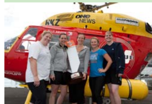
The 'Westpac Wonder Women' team take the top trophy in 2011's first corporate bootcamp.

Late last year a Corporate Chopper Challenge was launched which puts business' staff teams through a six week 'Boot Camp' involving early morning starts three days a week to complete a variety of fitness exercises. Teams also rally their friends and family to get behind them to sponsor their efforts, and at a prize-giving breakfast BBQ at the hangar, the coveted top-team trophies are awarded and winners treated to a scenic flight in the Westpac Rescue Helicopter.